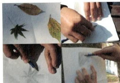
▲What are the different things of each tree?