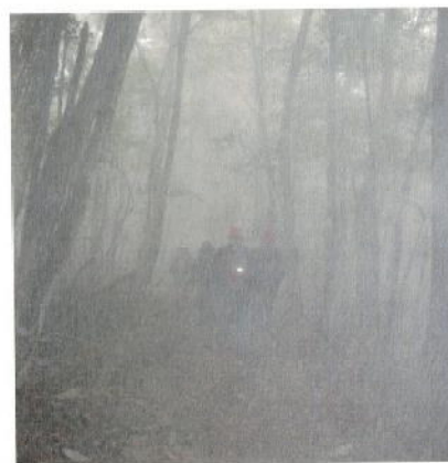
▲A typical temperate forest